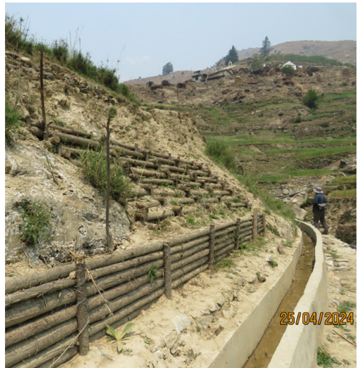
Multilayered bioengineering technique: Wooden crib wall and check dam constructed in Jumla, Nepal to prevent agricultural lands from erosion

The main operation costs of bioengineering measures are linked to the labour required to maintain the vegetable components of the system. Proper care and maintenance are particularly crucial in the initial stage. The plantations can be washed away or die due to over watering if planted in river banks. There is also a chance that they might die if planted on very dry, steep slopes. In order to reduce such risks, the location in which the bioengineering solution is to be implemented and the season should be considered. Once the vegetation has consolidated, regular care such as timely cutting, cleaning and pruning is needed. In addition to this, repairs to both the vegetation (e.g. repairing palisades or replanting vegetation) and the inert components (e.g. repairing wires, sealing cracks in walls) should also be taken into consideration.