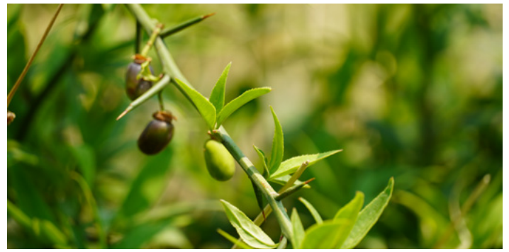
Branch of Prinsepia utilis , or Dhatelo, with its distinctive fruit.

Multilayered bioengineering that integrates vegetation with deep root systems along with engineering techniques is highly suitable for stabilising slopes. This approach employs multiple layers of reinforcement to adapt to varying environmental conditions while providing stability and reducing erosion. In steep areas and on degraded land, a combination of land use planning, engineering and environmental management is required. Multilayered bioengineering practices often combine three types of components: Grasses, stone walls or gabions, and shrubs. Grasses with long, deep roots can stabilise the soil on slopes, provide surface cover, reduce surface runoff, and catch debris. Depending on the requirements and the topographic conditions of the area, different species of grasses can be used. For example, vetiver grass is used as an efficient bio-technology to protect slopes in many countries due to its long life, strong, long, finely structured root system, and its high tolerance of extreme climate conditions 3 .